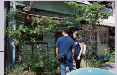
Stop for a snack at Hattifnatt - it's like a cafe in a treehouse!