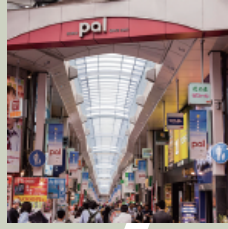
Pal Street has a roof so it makes great shopping even on rainy days