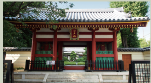
Chosenji Temple overlooks a wide street that is the center of an amazing spread of vintage clothing shops

The Southwest vintage area features 3 main areas: the covered shopping arcade Pal Street and its adjacent areas, Etoile Dori Street , and the long Look Street which continues from Pal Street.