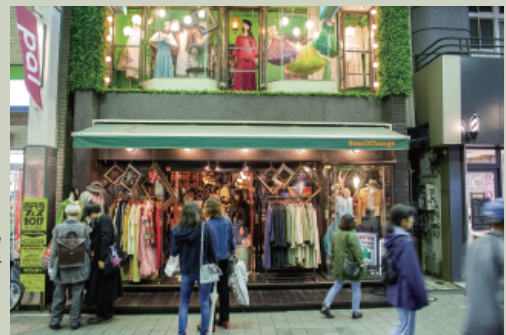
Vintage shopping on Pal Street