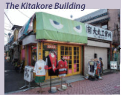
Kitakore Building The Kitakore Building

The area north of the station doesn't have the same overwhelming amount of vintage shops as the south, but it does have some good used kimono and the Kitakore building, famous for original remakes.