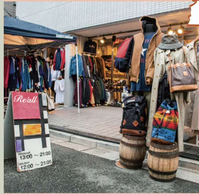
The center street of the Southeast area is a treasure trove of vintage shops like Whistler/Chart, Gasoline, S.O, Fifty-Fifty, Re'all, and more.

The area south of Koenji Station and east of Konan Dori Street is the other main vintage clothing area of Koenji. Most shops are sprawled out in the area between Hikawa Shrine and Chuo Park, and many on the side streets are a bit hard to find. All of them have something unique to offer and showcase the true vintage offerings that Koenji has become known for.