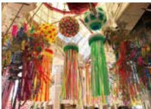
Asagaya Tanabata Festival is held the first weekend of every August. Many Tanabata decorations hang from the ceiling of the shopping street.

If you wish to buy yukata, inexpensive mass-produced sets are available at supermarkets or online but you can also take the plunge and visit a specialty shop. Nishi Ogikubo is a town with many second-hand kimono shops. You can also get unique antique yukata at reasonable prices. When you come to Tokyo, why not head to the Suginami festivals in yukata?