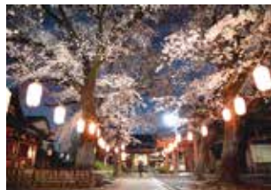
Renge-ji Temple Ogikubo, where the combination of the temple and the cherry blossoms is beautiful, is a true hidden gem. You can have the illuminations all to yourself at night.

To leisurely enjoy the sakura with the mood of a picnic, we introduce Zenpukuji River Green Park, mostly unknown by overseas tourists. Only 10 minutes by train from bustling Shinjuku, there are even many Japanese surprised to find such a place here. About 1 kilometer of cherry trees continue along the river with a promenade, where there are many park areas and benches, as well as places selling bento lunchboxes, making it the perfect spot for friends and families to enjoy a light picnic lunch. You'll also see people jogging through essentially a tunnel of somei-yoshino blossoms, the most common type. The sakura here can be appreciated during the day while taking a stroll or on a quiet night. However, for Japanese, maybe the limited-time beauty of sakura is just a good excuse to party?