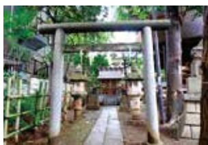
People come to pray for fine weather. However, maybe some people want their work to be canceled due to rain.