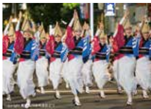
Tokyo Koenji Awaodori Festival is held the last weekend of every August. Festival Dancers practice for this weekend. Many local restaurants set up a stall on the street.