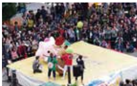
● Koenji Festival