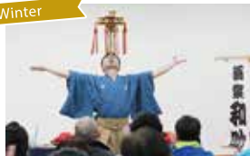
● Koenji Engei Festival