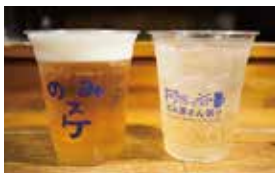
● Asagaya Bar-hopping Festival