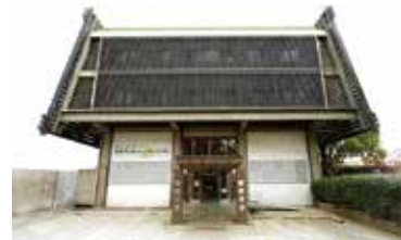
Tokyo Polytechnic University Suginami Animation Museum