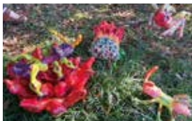
● Trolls in the Park (Outdoor Art Festival)