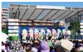
● Suginami Festa