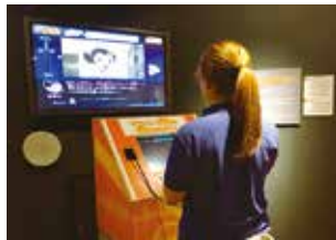
Adults and children can enjoy the dubbing experience where you can add the lines of popular anime characters with your own voice.