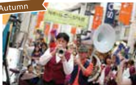
● Asagaya Jazz Street