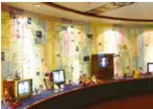
You can learn a lot from the timeless animation history exhibition