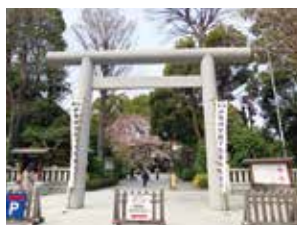
Asagaya Shinmeigu Shrine Address: 1-25-5, Asagaya-Kita, Suginami Web: https://shinmeiguu.com/ Facebook: @shinmeiguu

At Asagaya Shinmeigu Shrine, a few minutes' walk North of Asagaya Station, their Goshuin designs change annually and seasonally. Their 2019 edition adorned with embroidered cherry blossom motif added to the calligraphy design proved very popular. Autumn versions came with embroidery of red maple leaves or chrysanthemum crests. Such elaborate designs of Goshuin may ignite your collector's spirit.