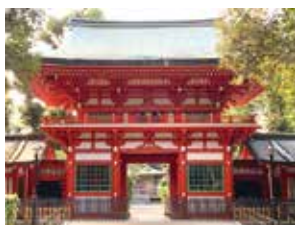
Igusa Hachimangu Shrine Address: 1-33-1, Zenpukuji, Suginami Web: https://www.igusahachimangu.jp/in dex2.html 20 minutes on foot from Nishi Ogikubo Sta. Buses available.