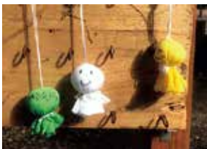
There are colorful “Teru-Teru Bozu” in the shrine.