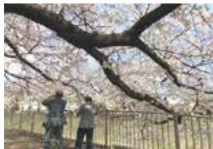
Zenpukuji River Green Park is popular for its tunnel-like rows of cherry blossom trees that invite you to walk through.