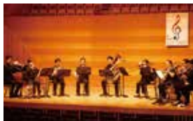
● Ogikubo Classical Music Festival