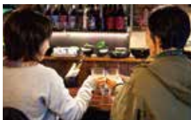
● Asagaya Bar-hopping Festival