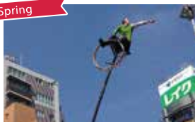
● Koenji Street Performance Festival